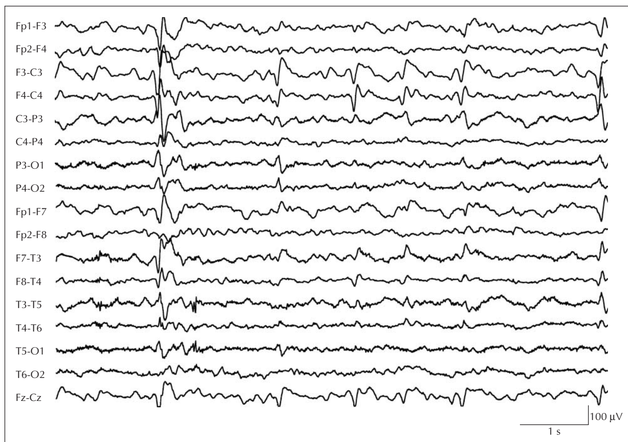
Figure 1. EEG while awake during therapy with sulthiame and valproate showing left-sided slowing and bilateral precentral sharp slow waves with generalisation.

At age 6 1/2 years, VPA was tapered off. Four months later, partial motor seizures of the right hand and nocturnal