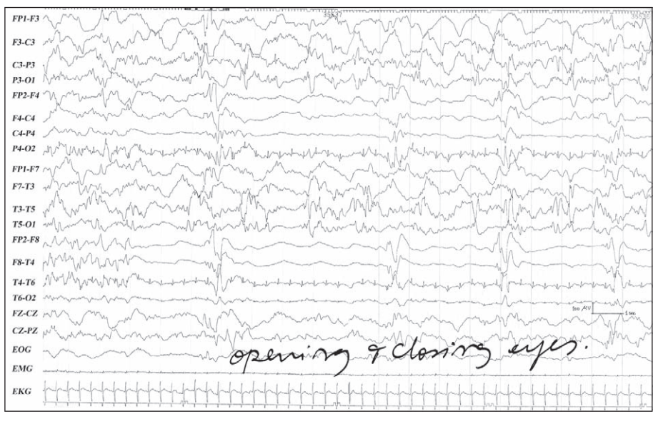
Figure 1. Ictal EEG before pyridoxine treatment (patient 1) during unresponsiveness, eye fluttering and eye deviation showing: (1) left-sided semi-rhythmic sharp and slow wave activity, and (2) concurrent right temporal periodic discharges with beta discharges followed by semi-rhythmic sharp and slow waves.