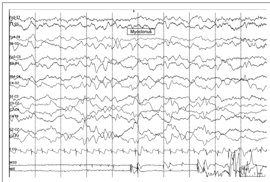
Figure 1. Neonatal electroencephalographic (EEG) montage, electrocardiogram (ECG) and electromyogram of right upper and left lower limbs (MSD and MIE) during sleepiness when occurs a brief myoclonic jerk with movement artifact represented in upper and lower limbs, without any alteration of EEG.

Continuous, twenty-four hour-registered traces demonstrated brief erratic myoclonic jerks, during sleep and sleepiness, affecting the head and upper limbs, involving mainly flexor muscle groups. Occasionally, some jerks of the low left limb were observed ( see video sequence ). Bouts of myoclonic jerks lasted, at most, 50 seconds.