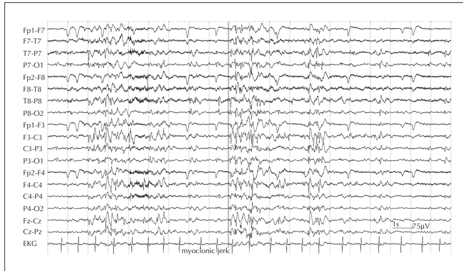
Figure 1. EEG during the myoclonic status epilepticus (before the administration of levetiracetam). Frequent myoclonic seizures correlated with a generalised and irregular polyspike pattern.