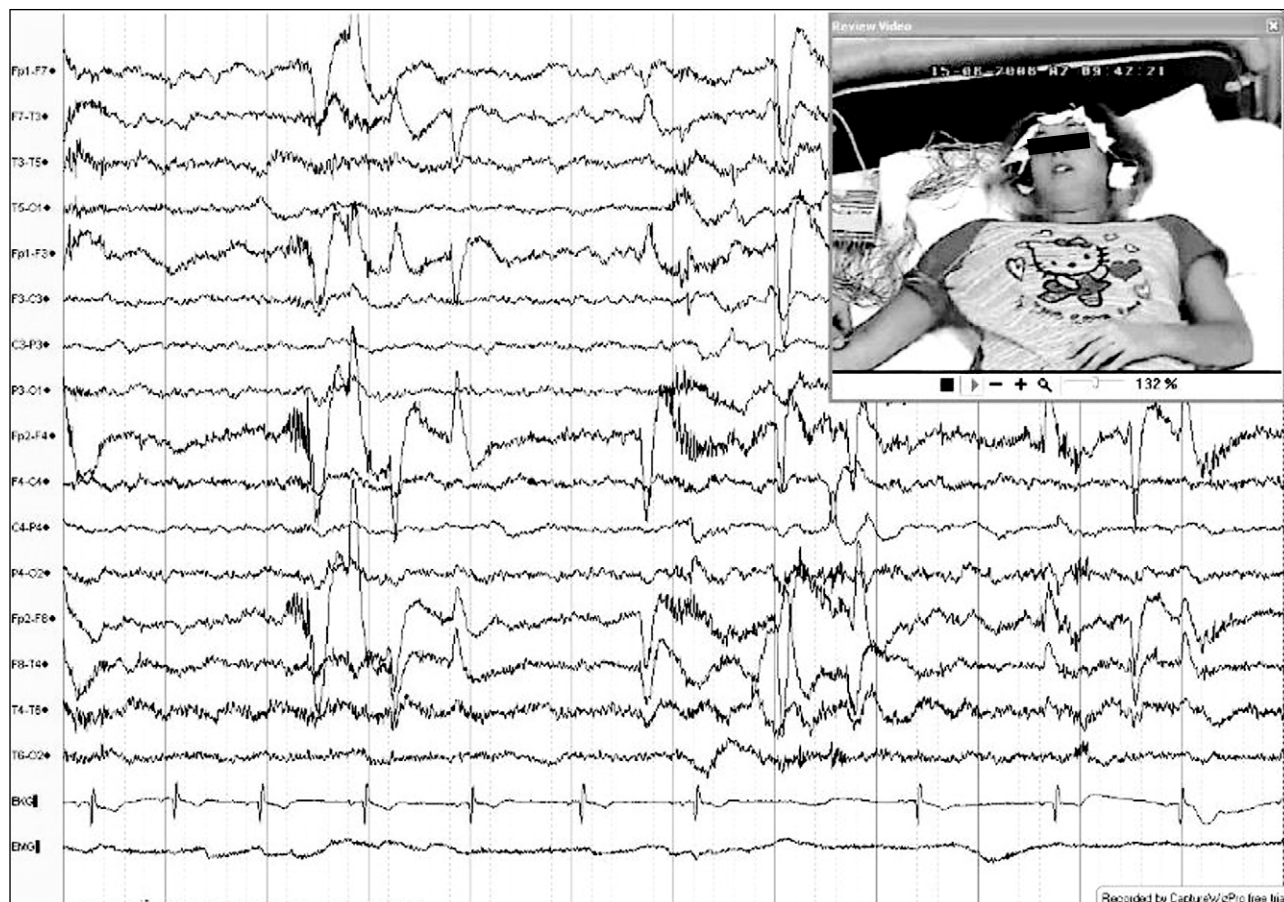
Figure 1. When the heart rate began to slow down, the patient warned that she was feeling dizzy.

In the first part of the episode with bradycardia and asystolia, the clinical semiology was very much similar to an epileptic event with head/eye deviations, automatism and dystonic posture. In particular, the second phase of massive body jerks implied a convulsive episode, although this was induced by cerebral hypoxia with diffuse delta discharges without any epileptiform activity on EEG.