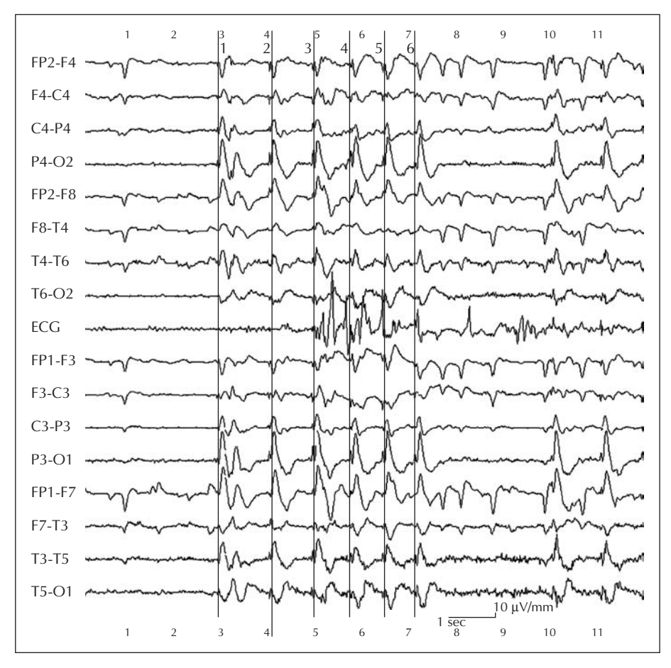
Figure 1. Standard EEG during a chess game (amplitude: 10 microvolts/mm, time constant 0.1, 15 Hz filter): repetitive spike-wave discharges are maximum on fronto-central areas on both sides.

A systematic, prospective investigation of seizures, induced by higher brain activities has been carried out by Matsuoka et al. [4]. They found, in a series of 480 consecutive patients with epilepsies of various types, 38 pa-