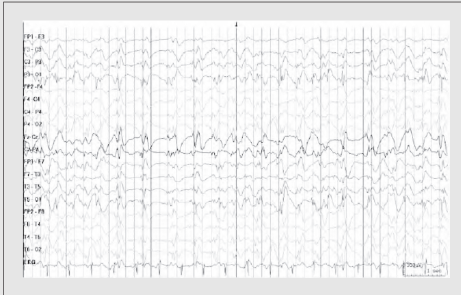
Figure 4. EEG showing slow spike-wave discharges.