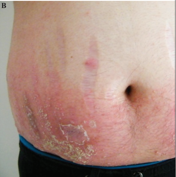
Figure 1. A) Pustular psoriasis of the left thigh. B) Abdominal pustular psoriasis.

inflammation. No infectious cause was found. The hypothesis of an auto-inflammatory disease was suggested. The c.115+6T>C homozygous mutation of the IL36RN gene on chromosome 2q13 (indicating DITRA) was detected. TNF-alpha inhibitor treatment was initiated with 50 mg etanercept administered twice weekly for 12 weeks, followed by 50 mg per week. Significant improvement was rapidly noticed with disappearance of psoriasis within two weeks, leading to complete remission for a period of three years