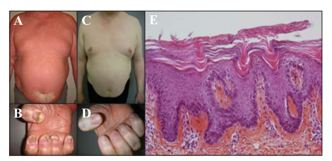
Figure 1. A, B) Clinical appearance of the patient at initial consultation. C, D) Seven months later, while still under apremilast 30 mg twice daily, complete remission was maintained. E) Biopsy showing hyperkeratosis forming a checkerboard pattern, follicular plug and lymphocytic perivascular infiltration (HEX \times 10 ).

A 47-year-old, overweight man presented with a one-month history of PRP, without arthritis ( figure 1A, B, E ). He first received ointments, then acitretin at 25 mg/day, with progressive rise to 40 mg, associated with UVB. Seven months later, the disease was not controlled, and erythema spread with severe palmoplantar keratoderma and dystrophy of