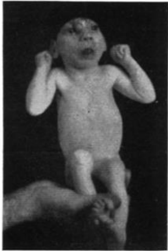
Abb. 6 a.

Supplementary figure 1. The Moro reflex elicited in an anencephalic infant. The figure is taken from the original report by the Austrian neurologist, Eduard Gamper (1887–1938), Head of the Department of Neuropsychiatry at the Charles University's German Faculty of Medicine in Prague, with the first medical description of anencephaly [1].