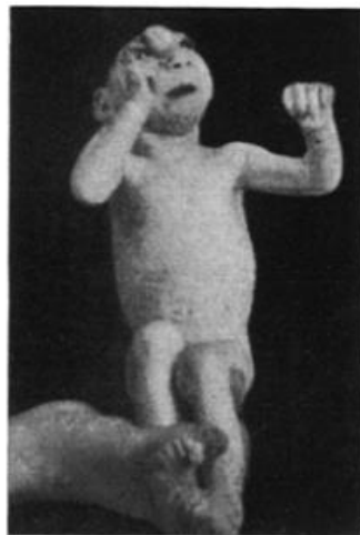
Abb. 6 c.

Abb. 6a – c. Moroscher Umklammerungsreflex bei Anblasen des Kindes. Dorsalflexion des Kopfes, Abduction in beiden Schultergelenken unter Streckung der Vorderarme und Handgelenke, darauf (c) Adduction in beiden Schultergelenken unter Beugung der Ellbogen.