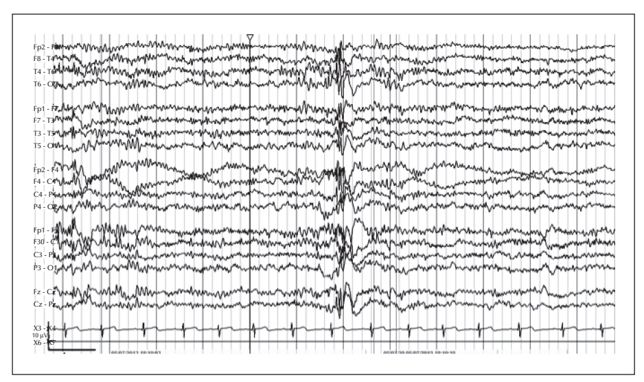
Figure 2. Follow-up EEG after adding sultiame. Infrequent generalised spike/polyspike-wave activity, but no absence seizures (even with hyperventilation).