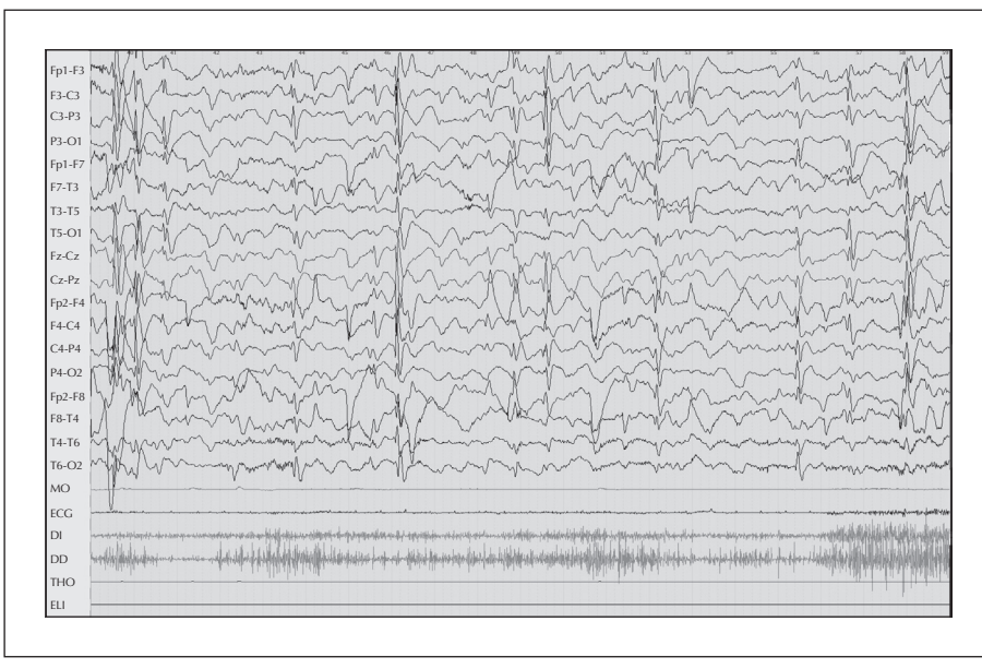
Figure 1. Interictal EEG of Patient 1 showing discharges over the midline (Cz), central, and frontal electrodes.

For Patient 2 (a 14-year-old girl), the clinical diagnostic criteria for classic RTT were met, with severe cognitive disability and without mutations in Rett-related genes. Social withdrawal appeared at 13 months, hand stereotypes at two years and six months, and loss of acquired language by three years. Her hand skills worsened, but did not disappear. Brain MRI was normal. She presented partial motor seizures at five years old, followed by absences, which were controlled with valproate. Four years later, she presented with proprioceptive reflex seizures, self-triggered by rhythmic pressure on her left hand, which led to loss of social contact and tone, and backward falls. She self-provoked the attacks, taking someone's hand or holding onto a table. The episodes were influenced by stress, and she could prevent them at the beginning if she was asked to. Her reflex seizures were modified over the years: from the age of 13, before going to sleep, she would sit on the edge of the bed and rub the top of the bed in order to trigger a loss of social contact and fall onto a mattress. Interictal EEG showed diffuse slow background activity, multifocal spike-and-wave complexes and generalised spike-and-wave discharges. Although several EEG records were obtained, the patient never reproduced the reflex seizures while monitored. However, during both home videos and neurology consultation, she presented the above-described episodes.