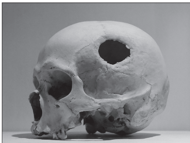
Figure 1. Trephined skull. No signs of trauma, and bone apposition confirms that the patient survived for a considerable time. Inca, Precolumbian period.

If "idiopathic" was synonymous with a cause specific to the brain, epilepsy caused by primary brain lesions, such as a brain tumour, would belong to this definition which was indeed still the view in the early 19th century (Temkin, 1971). This necessitated a precision, because in these cases, epilepsy was clearly the secondary symptom to another pathology and not the disease proper. Delasiauve (1854) introduced the distinction which is still in place for idiopathic epilepsy with merely functional deviations from symptomatic epilepsy, in which a more or less appreciable cerebral lesion was found.