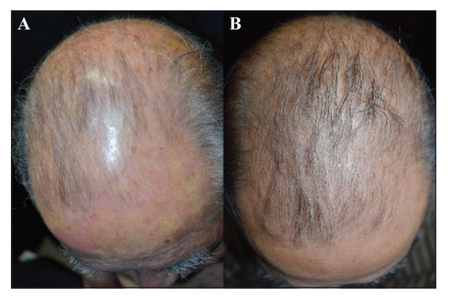
Figure 1. Clinical manifestation before (A) and after (B) secukinumab administration.